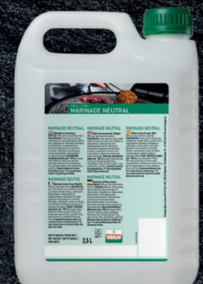
114102 2,5 lt 1 * Marinade Neutral