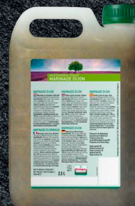
130902 2,5 lt 9 10 Marinade Dijon