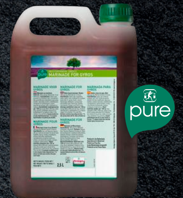
131102 2,5 lt Marinade for Gyros