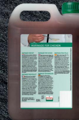
137402 2,5 lt 1 6 9 10 Marinade for Chicken