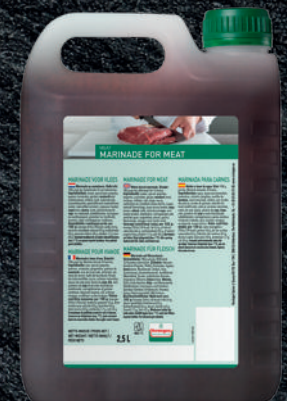
137302 2,5 lt 1 6 10 Marinade for Meat