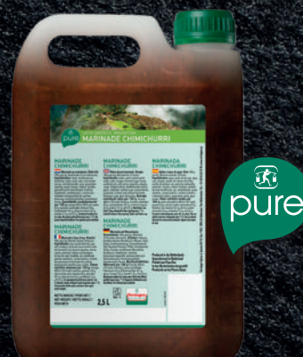
252202 2,5 lt Marinade Chimichurri