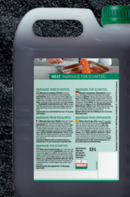
1038902 2,5 lt 1 6 7 Marinade for Schnitzel