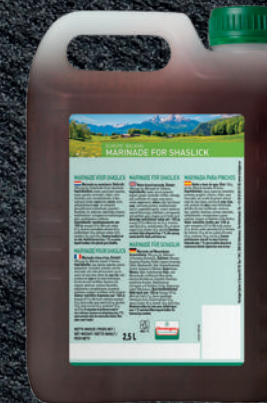
139002 2,5 lt 1 6 Marinade for Shaslick