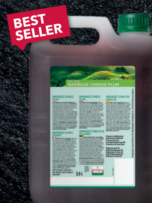
126902 2,5 lt 6 10 Marinade Chinese Plum