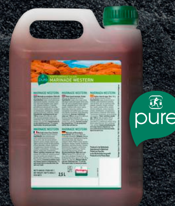
130402 2,5 lt Marinade Western