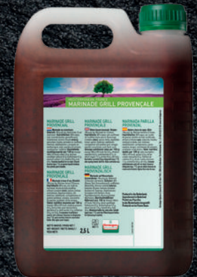
139802 2,5 lt 1 6 9 10 Marinade Grill Provençale