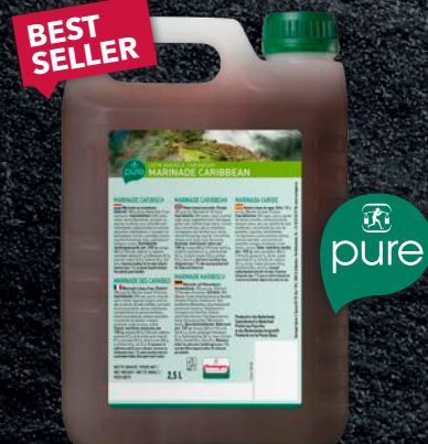
130802 2,5 lt Marinade Caribbean