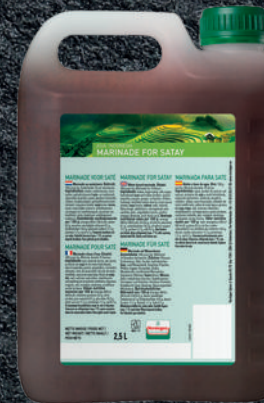
137802 2,5 lt 1 6 Marinade for Satay