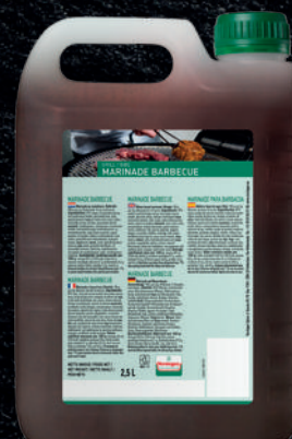
138302 2,5 lt 1 6 10 Marinade Barbecue